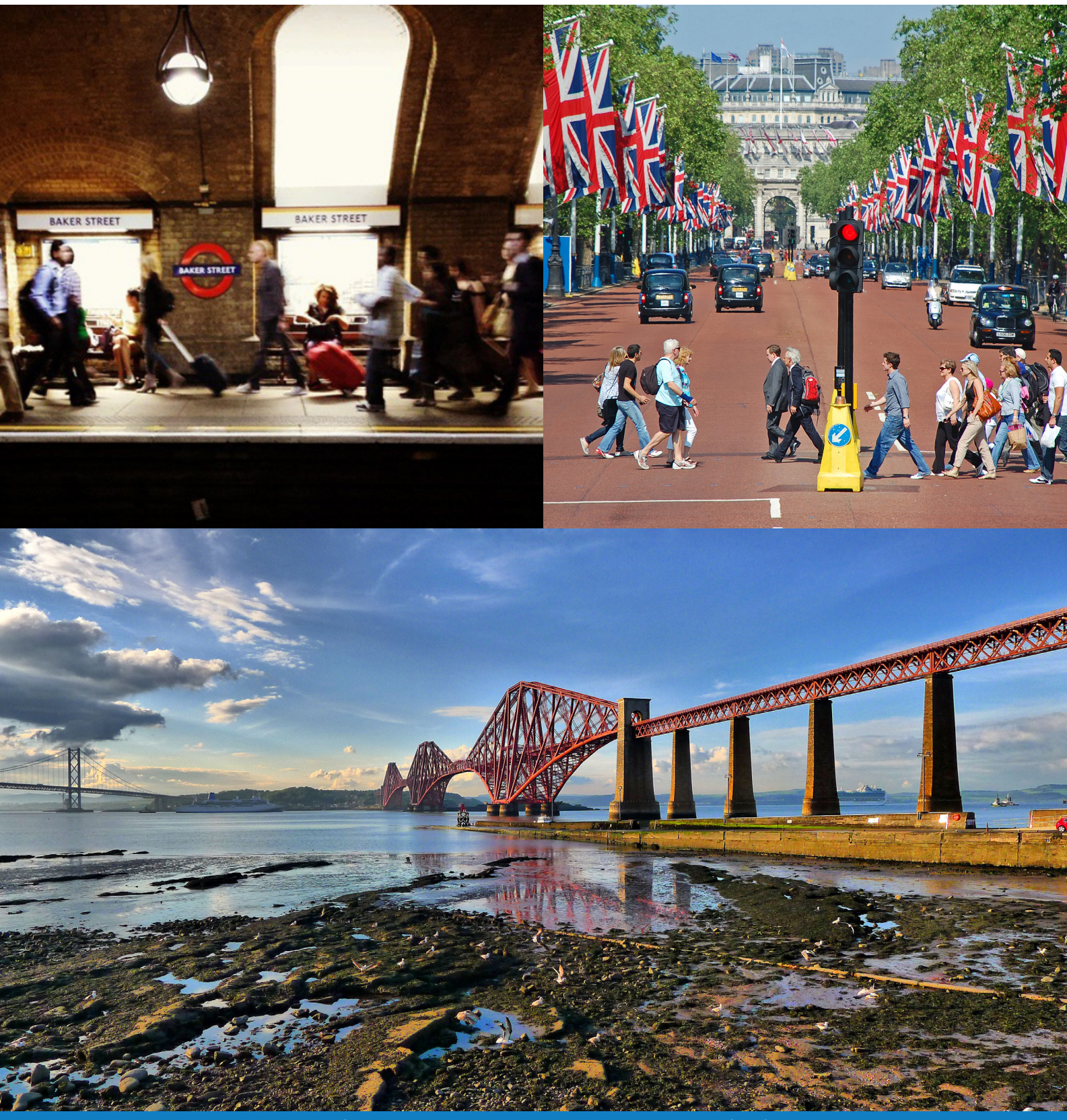
winners of the first TPS photo competition.